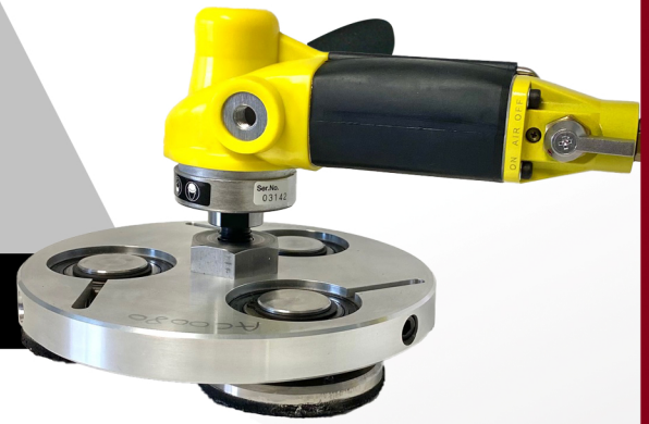
PadHead Model II on a grinder for flat polishing or honing

Up to 50% Faster Grinding Reduced Dust Particles/Slurry Low Cost per Square Foot Highest Quality Finish