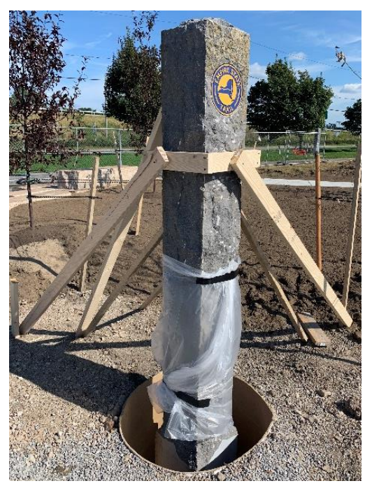
Our antique, authentic granite stone reclaimed from Western New York.