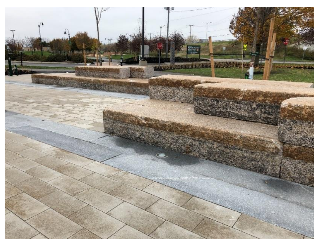
A view of both salvaged granite stone materials from EBS used for the design.

All parties involved did an excellent job designing the enhancements to the trail, continuing to make the Buffalo waterfront a world-class destination. Our team was thrilled to add that touch of history by providing the reclaimed, antique materials to their continued investment in the Buffalo waterfront and overall statewide tourism industry. The gateway park is a site to see!