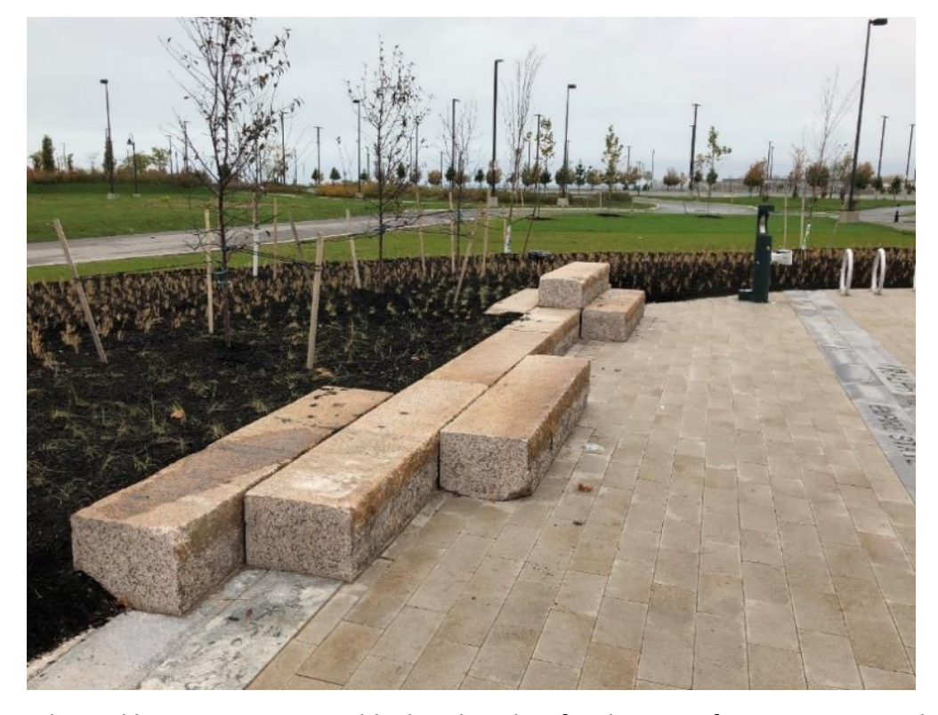
Reclaimed large stone granite block as benches for the waterfront gateway park.