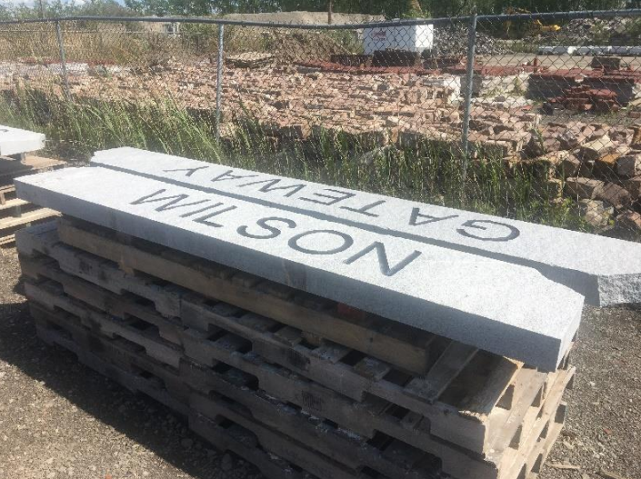
Prepping the granite curb for the project engravings.