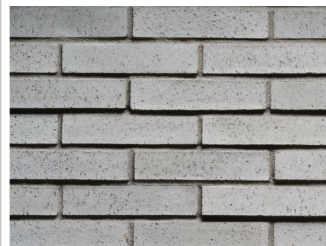
KULLEN™ TENLEY BRICK