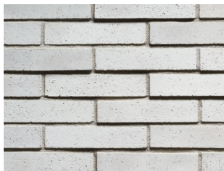
LOFTEN™ TENLEY BRICK