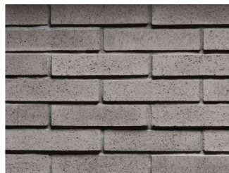
WILDON™ TENLEY BRICK