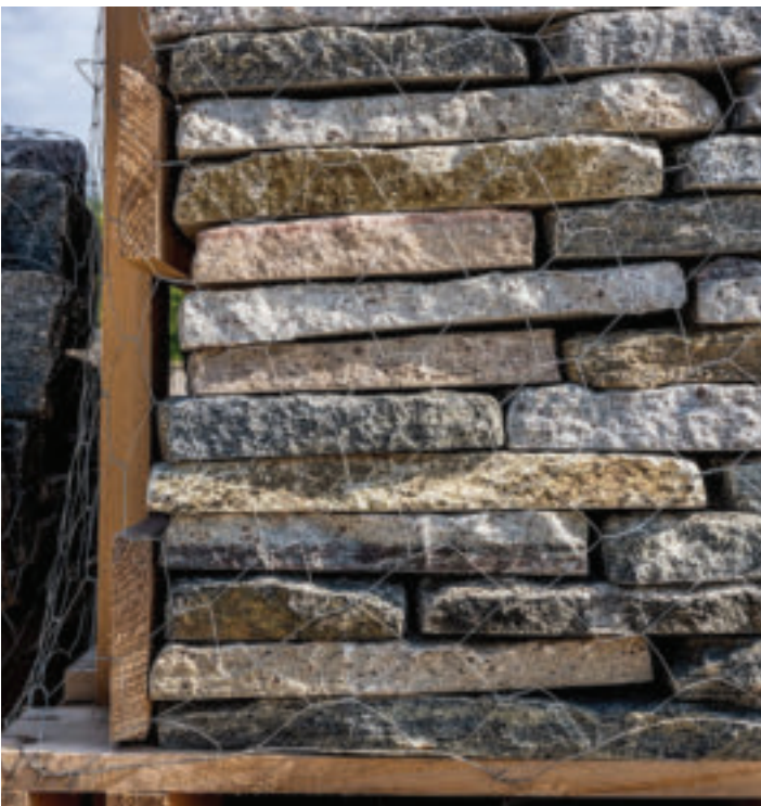
ADIRONDACK THIN VENEER