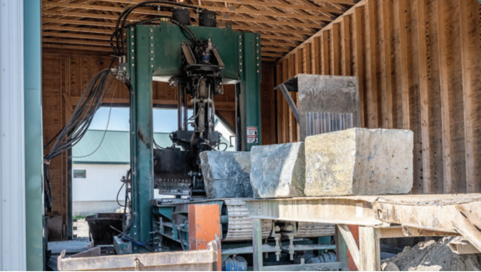
MENHIR 440 1600 X 1000 W/MP6RB, BCD & BTS | THE LARGEST STEINEX SPLITTER IN THE U.S.A. 484 ton splitting force with a 77" maximum opening | 63" blade length and 39.37" splitting height