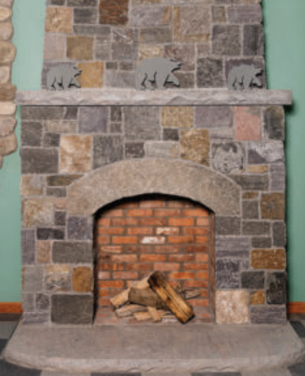
SQUARES AND RECTANGLES, ASHLAR, AND LEDGE MIX