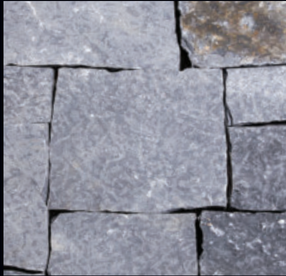
SQUARES AND RECTANGLES

Please call for availability on all products. Additional products may be available.