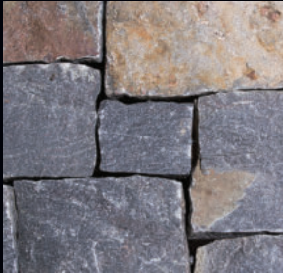
SQUARES AND RECTANGLES

Please call for availability on all products. Additional products may be available.