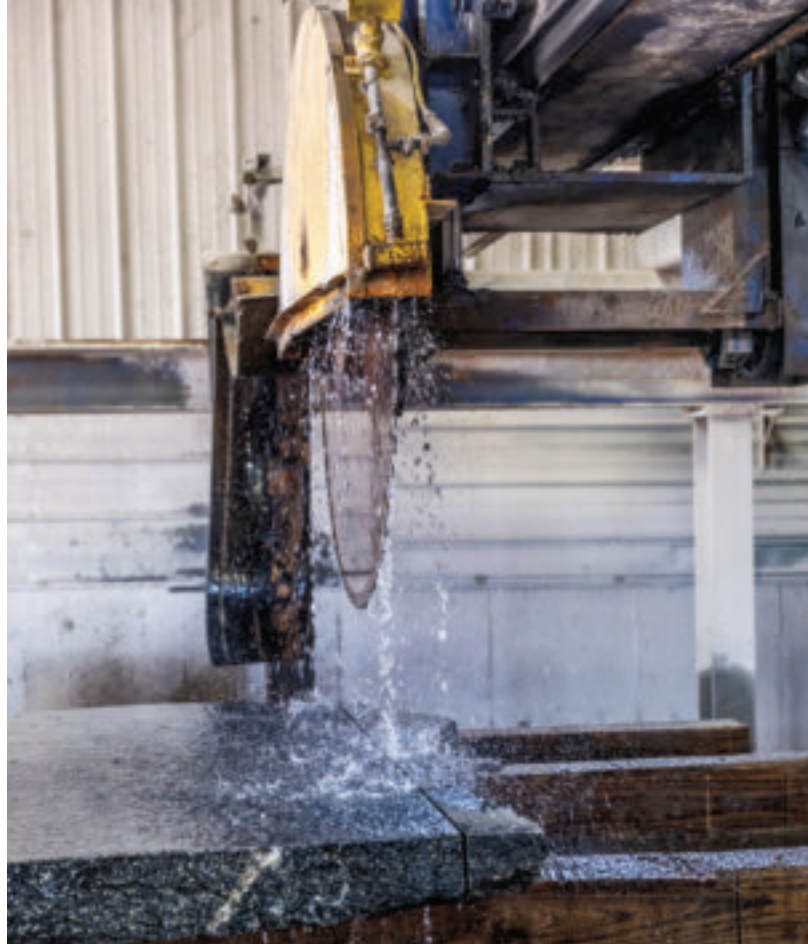
SMALL GANTRY SAW