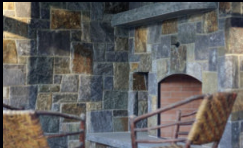
SQUARES & RECTANGLES