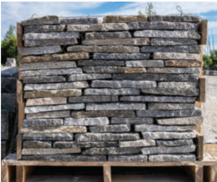
THIN VENEER FLATS (200 SQ. FT.)

Pallets of Thin Veneer are available in: 200 SQ. FT. | 100 SQ. FT.