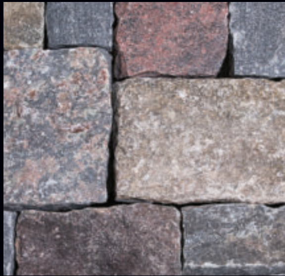
SQUARES AND RECTANGLES

Please call for availability on all products. Additional products may be available.