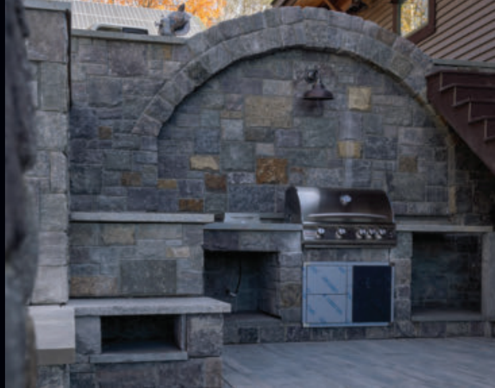
SQUARES AND RECTANGLES AND ASHLAR MIX