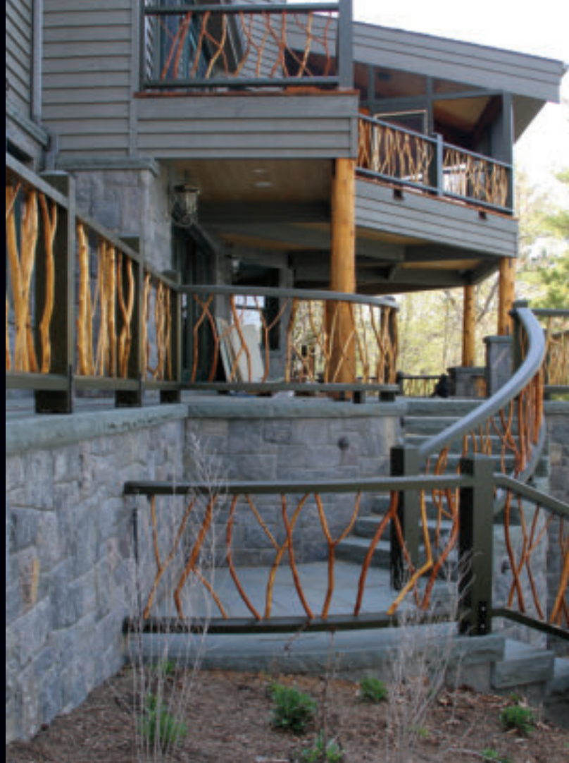
SQUARES AND RECTANGLES