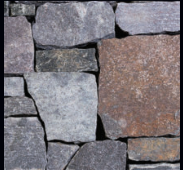
SETTLERS MIX VENEER