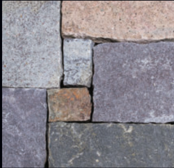
SQUARES AND RECTANGLES

Please call for availability on all products. Additional products may be available.