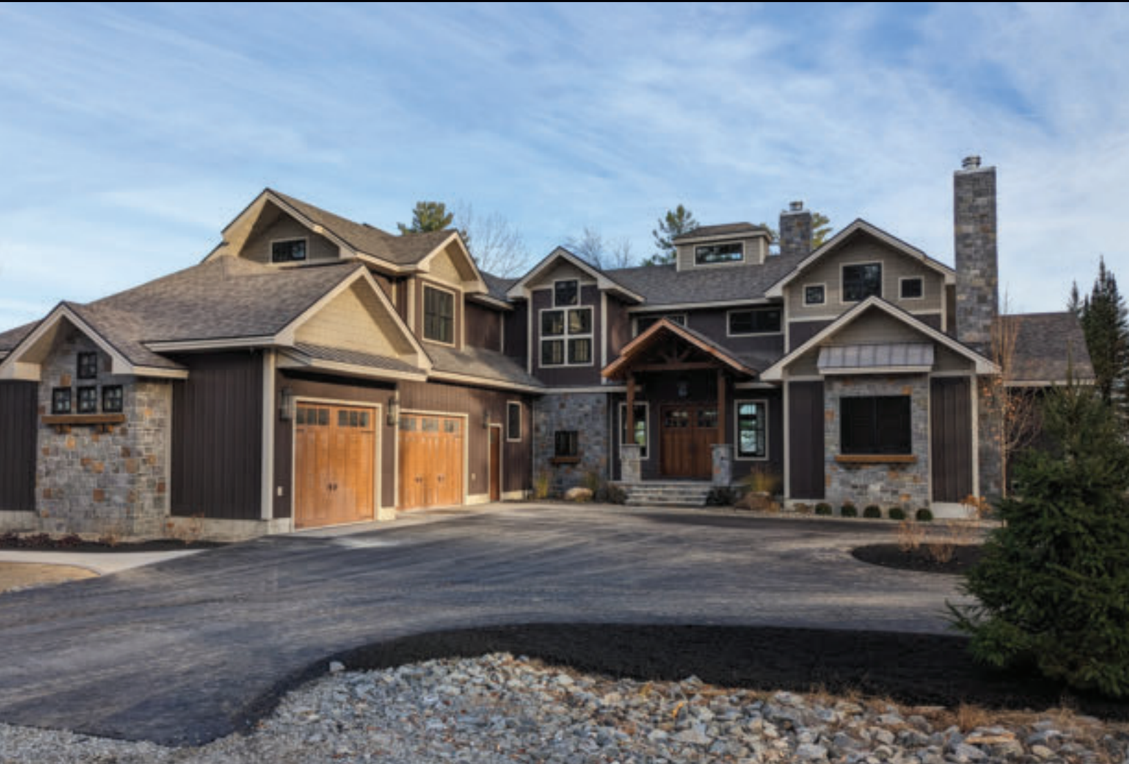
SQUARES AND RECTANGLES AND ASHLAR MIX