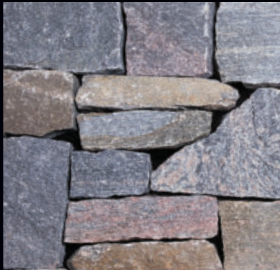
SETTLERS MIX VENEER