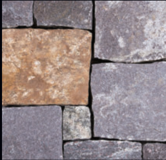
SQUARES AND RECTANGLES

Please call for availability on all products. Additional products may be available.