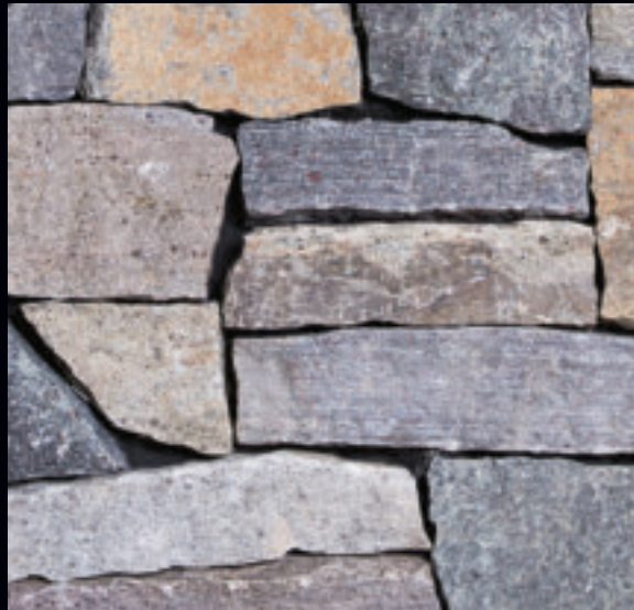
SETTLERS MIX VENEER