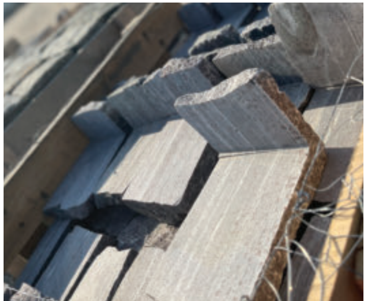
THIN VENEER CORNERS

Pallets of Thin Veneer are available in: 200 SQ. FT. | 100 SQ. FT.