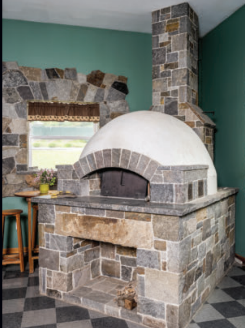
SQUARES & RECTANGLES