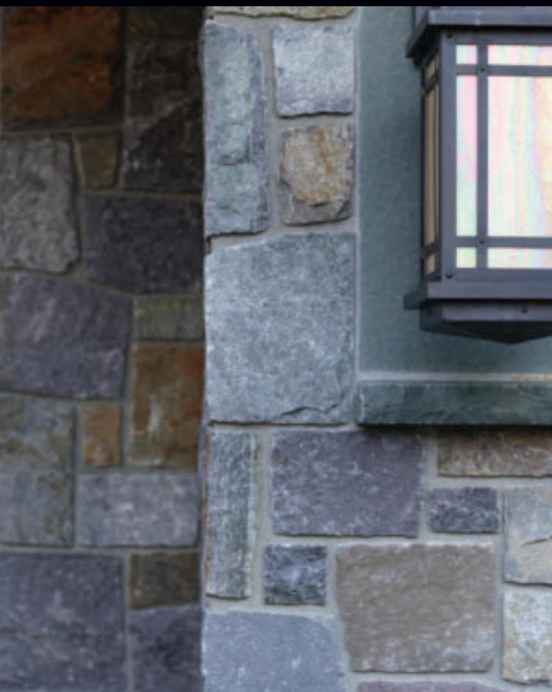
SQUARES & RECTANGLES