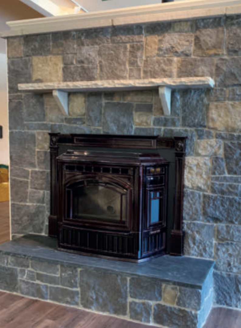
ASHLAR AND SQUARES AND RECTANGLES