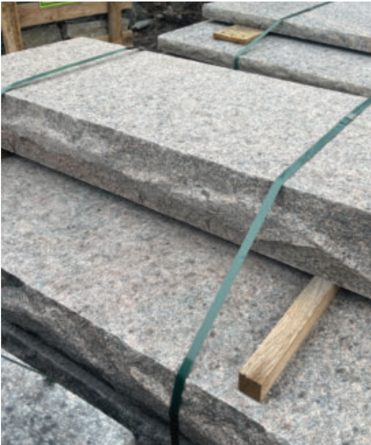
HAWTHORNE GRANITE FABRICATED STEPS WITH THERMAL TOP FINISH AND ROCKED EDGES