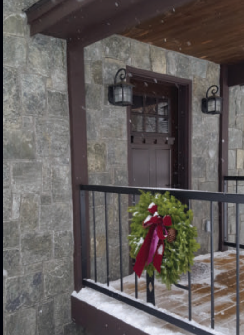
SQUARES & RECTANGLES