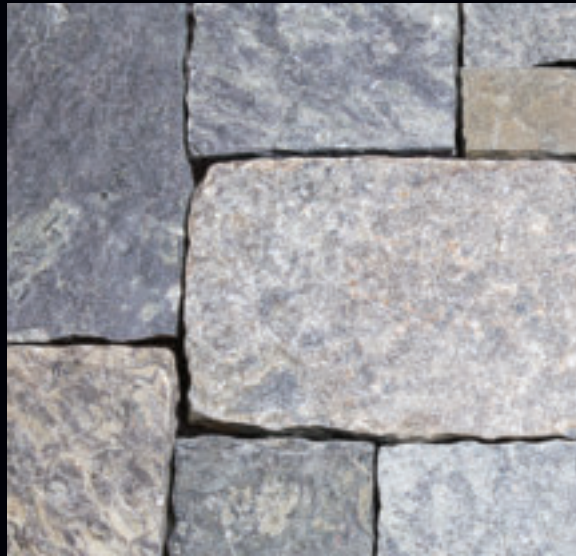
SQUARES AND RECTANGLES

Please call for availability on all products. Additional products may be available.