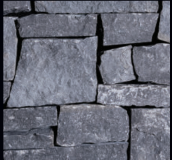
SETTLERS MIX VENEER