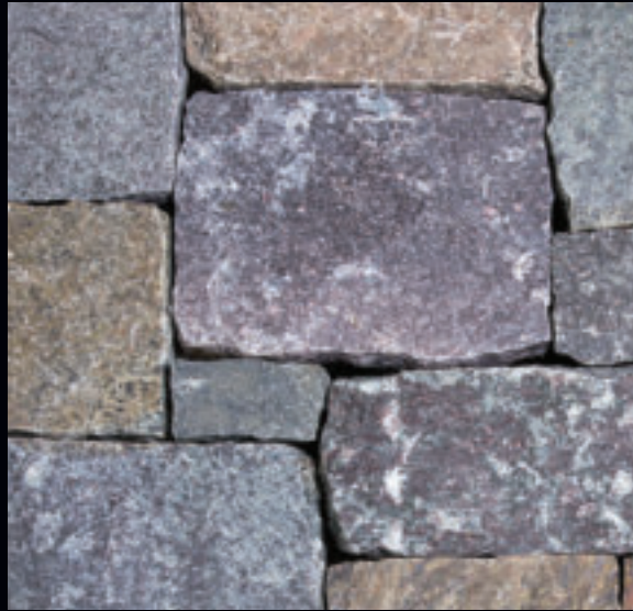
SQUARES AND RECTANGLES

Please call for availability on all products. Additional products may be available.