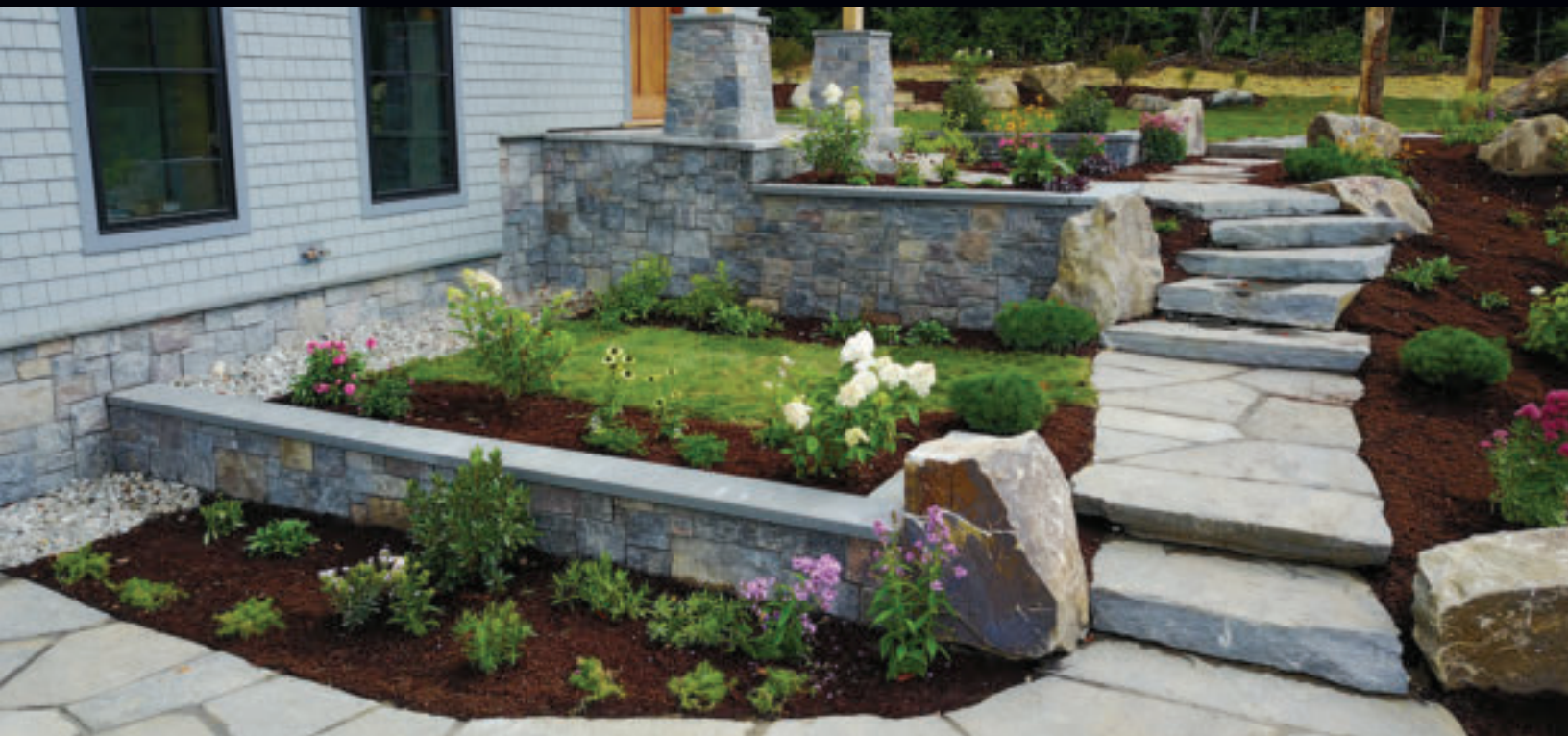
SQUARES AND RECTANGLES