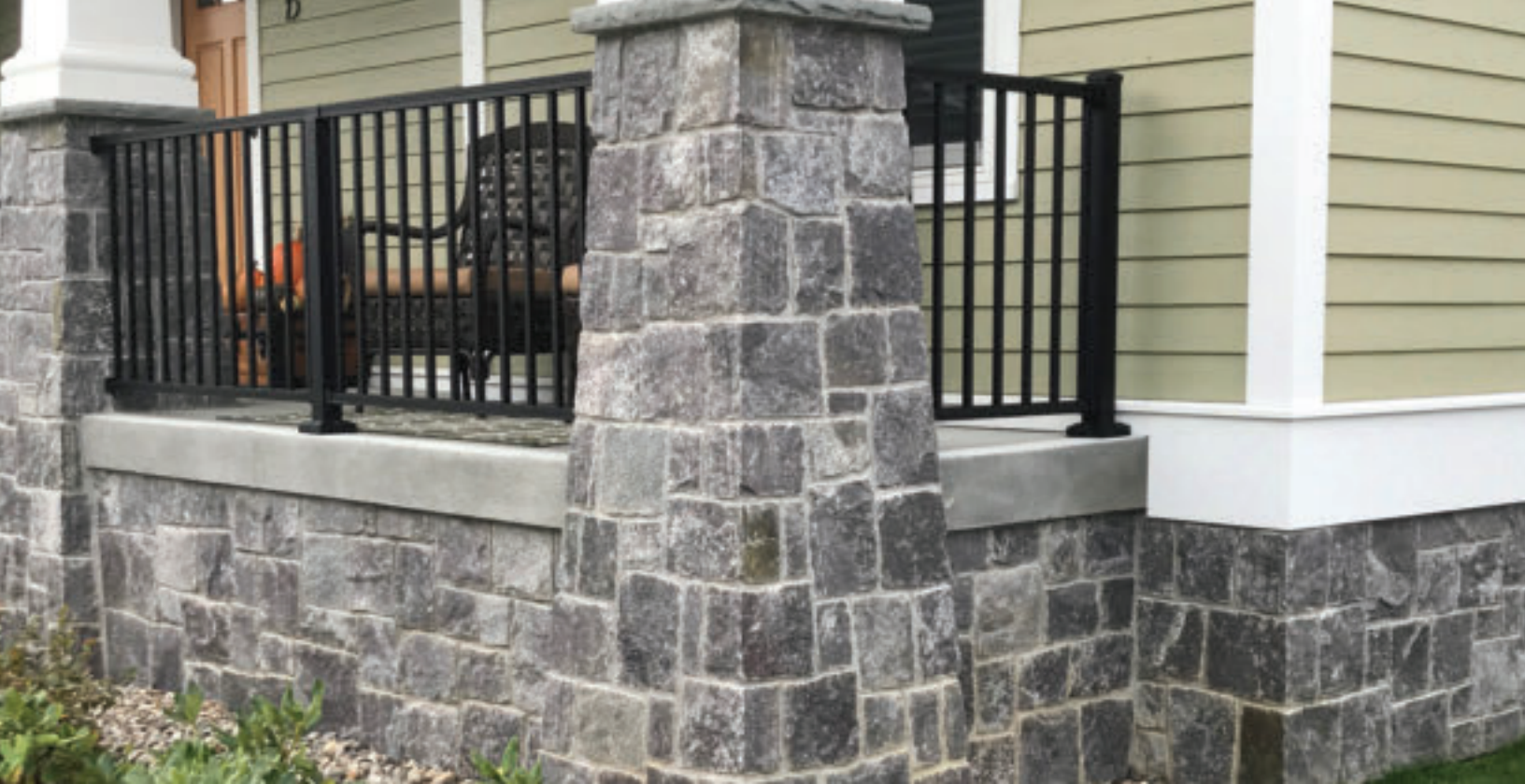
SQUARES & RECTANGLES