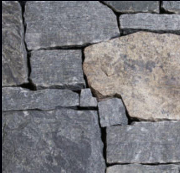
SETTLERS MIX VENEER