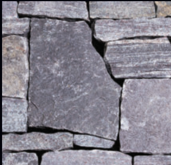
SETTLERS MIX VENEER