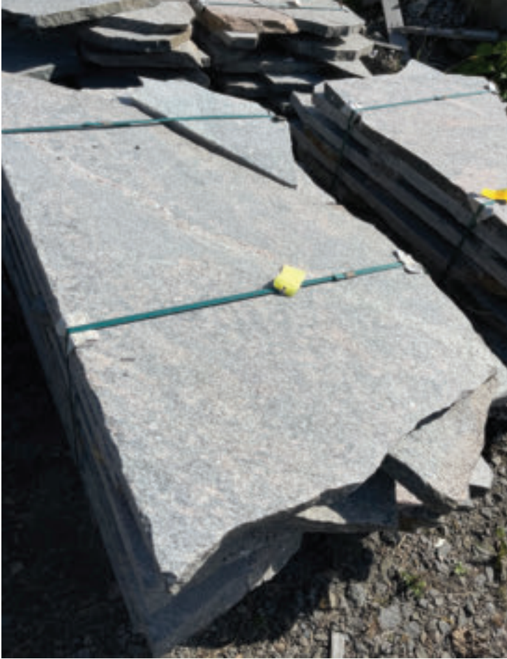
HAWTHORNE GRANITE FABRICATED IRREGULAR 2" FLAGGING WITH THERMAL FINISH