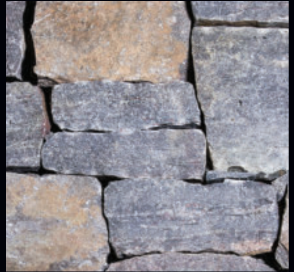
SETTLERS MIX VENEER